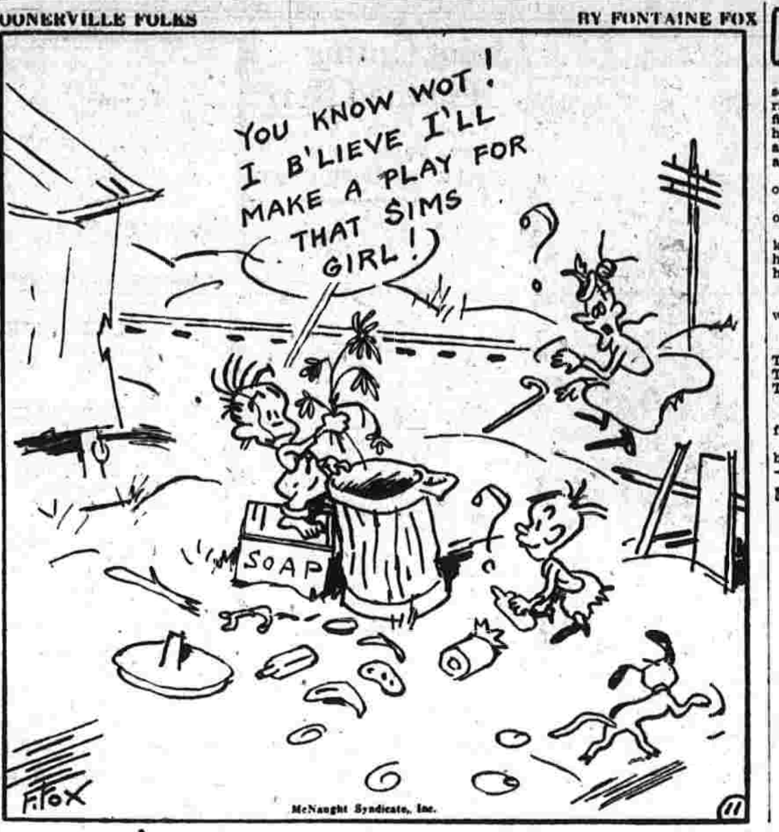
McNaght Syndicate, Inc.